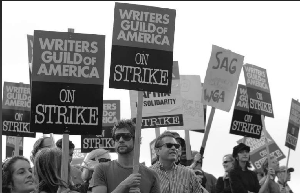
'WRITERS IN LIMBO' BY RICH GREENE (Silver Medal)