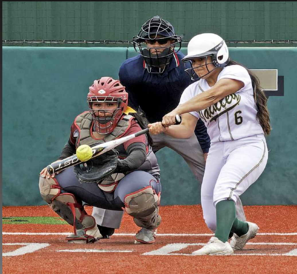
'BATTER UP' BY DALE BECK (Honor Award)