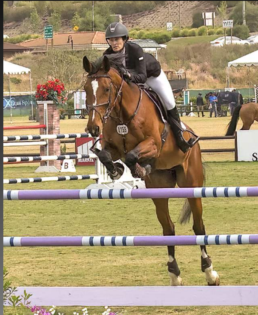
'UP AND OVER' BY SANDRA CRANTZ, QPSA FS4C (Honor Award)