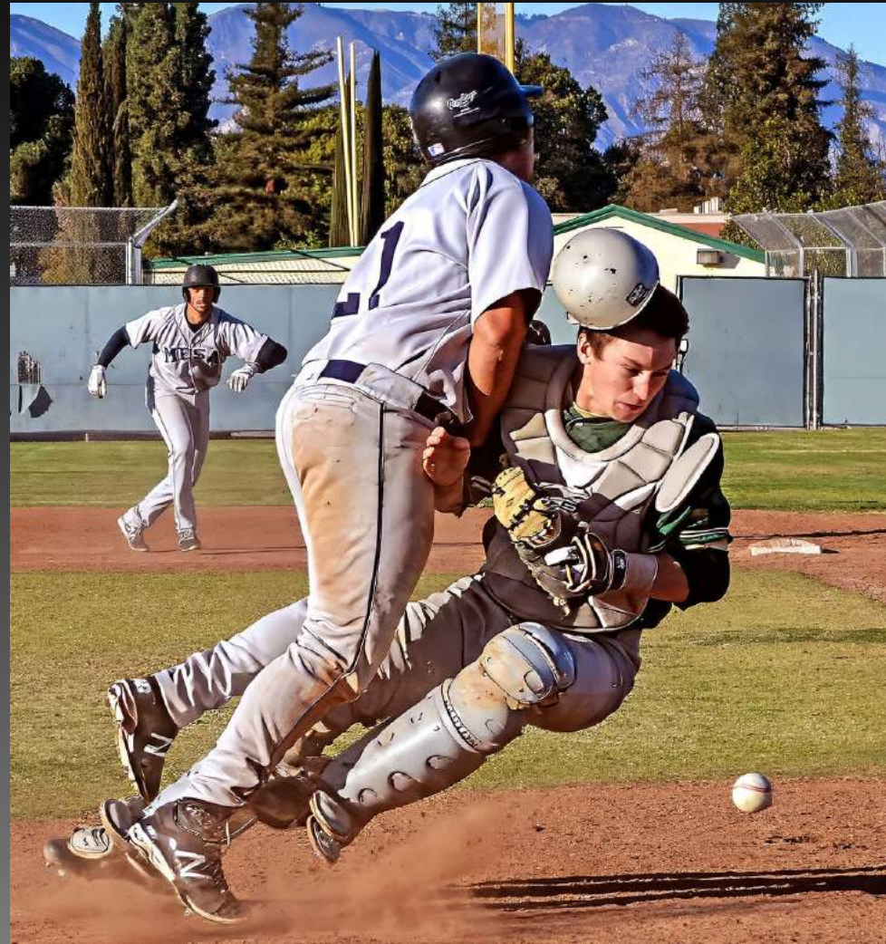
'COLLISION AT HOME PLATE' BY DALE BECK (Honor Award)