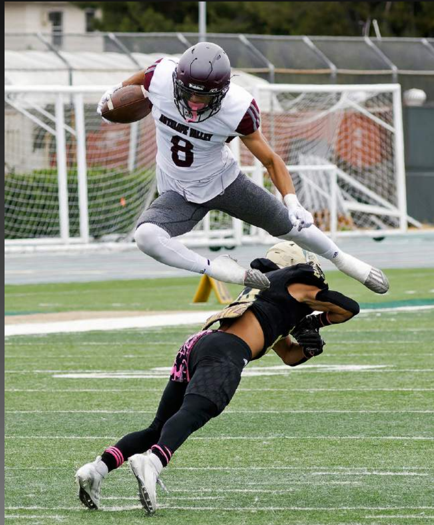
'VAULTING OVER THE TACKLER' BY DALE BECK (Gold Medal)